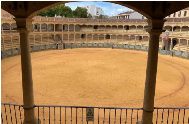
Ronda – view from Parador

The Parador hotels are a group of government-run hotels that are usually adjacent to or within many historical landmarks in Spain including castles, monasteries, and, in this case, the Puente Nuevo. These hotels are intended to bolster tourism by the Spanish government and offer a unique experience. We were