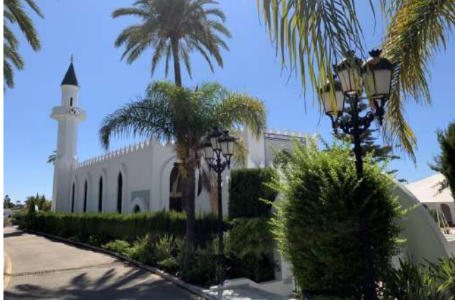
Abdul Azziz Mosque

pleasantly surprised to find Cafetería Armiñan, a halal restaurant, only two blocks away from the Parador in this quaint mountain town.